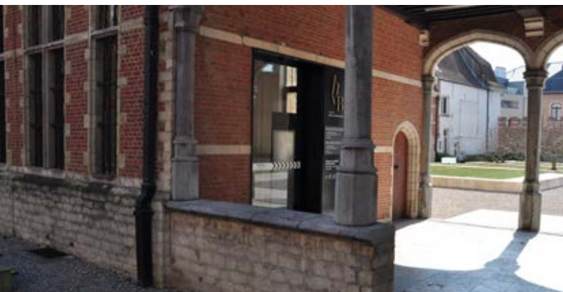
Entrance Frederik de Merodestraat

In the photo, the gate is halfway open. It may also be fully open.