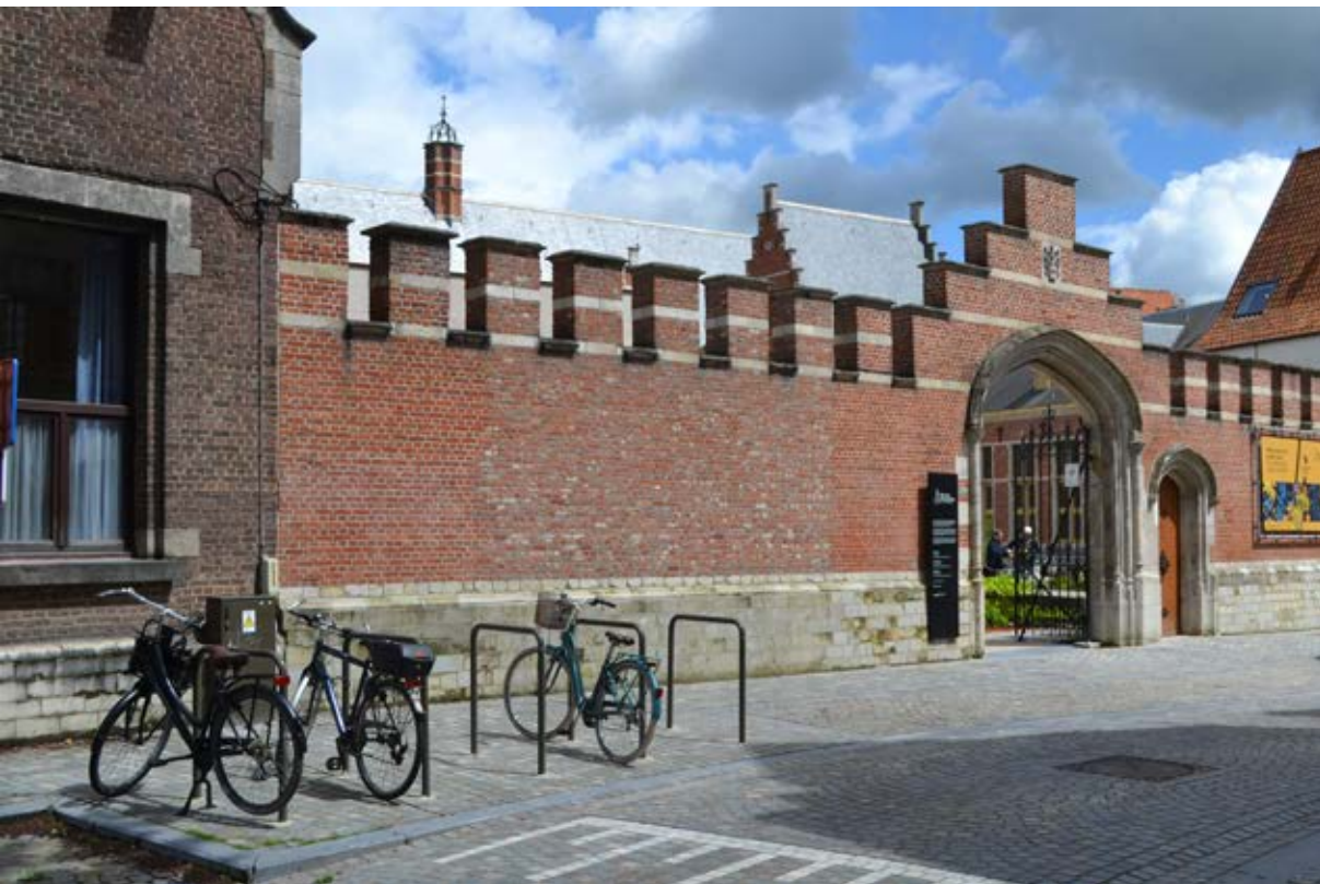
Bike rack Sint-Janstraat

I park my bike at one of the bike racks I find outside the museum.