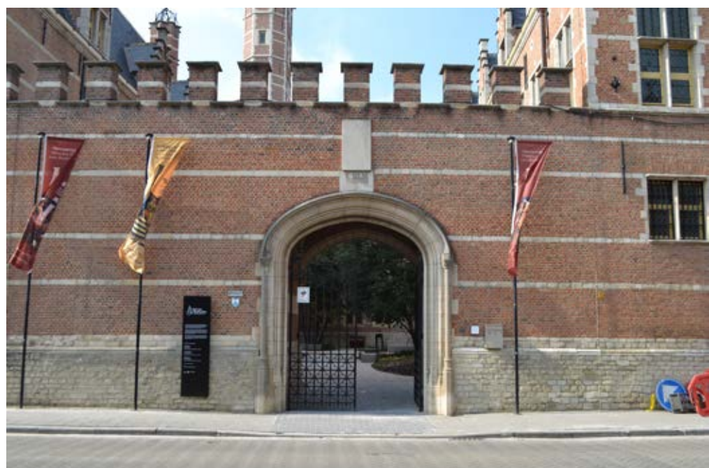
Entrance Frederik de Merodestraat

This route takes about 5 minutes. I turn right onto Van Busleydenstraat. I arrive at Jodenstraat. Here, I turn left. I reach Frederik de Merodestraat. Here, I turn right. I find the museum on my right.